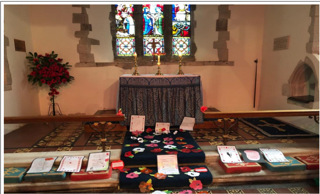
Poppies and poems from the pupils of Ashurst Primary School