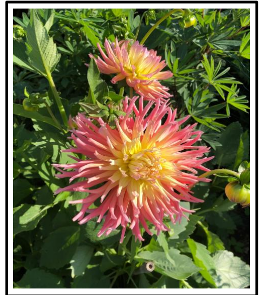
A stunning Dahlia

As world leaders gathered in Glasgow for COP26, it has certainly felt as if climate change is firmly upon us. Autumn has been dry and warm with the leaves, oak in particular, seemingly only changing colour and falling to the ground with the greatest reluctance.