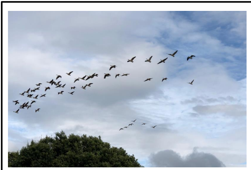
Geese on the move